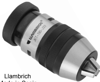
Llambrich Made in Spain