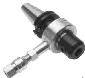
Includes Toolholder and Coolant Collar