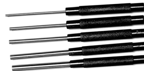
Long Drive Pin