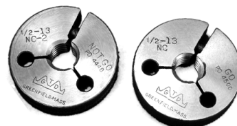
Thread Ring Gage (Handle sold separately)